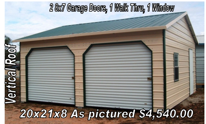
2 8x7 Garage Doors, 1 Walk Thru, 1 Window