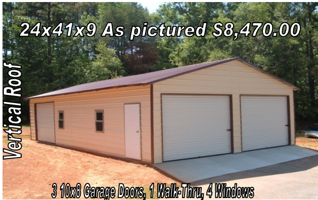
24x41x9 As pictured $8,470.00